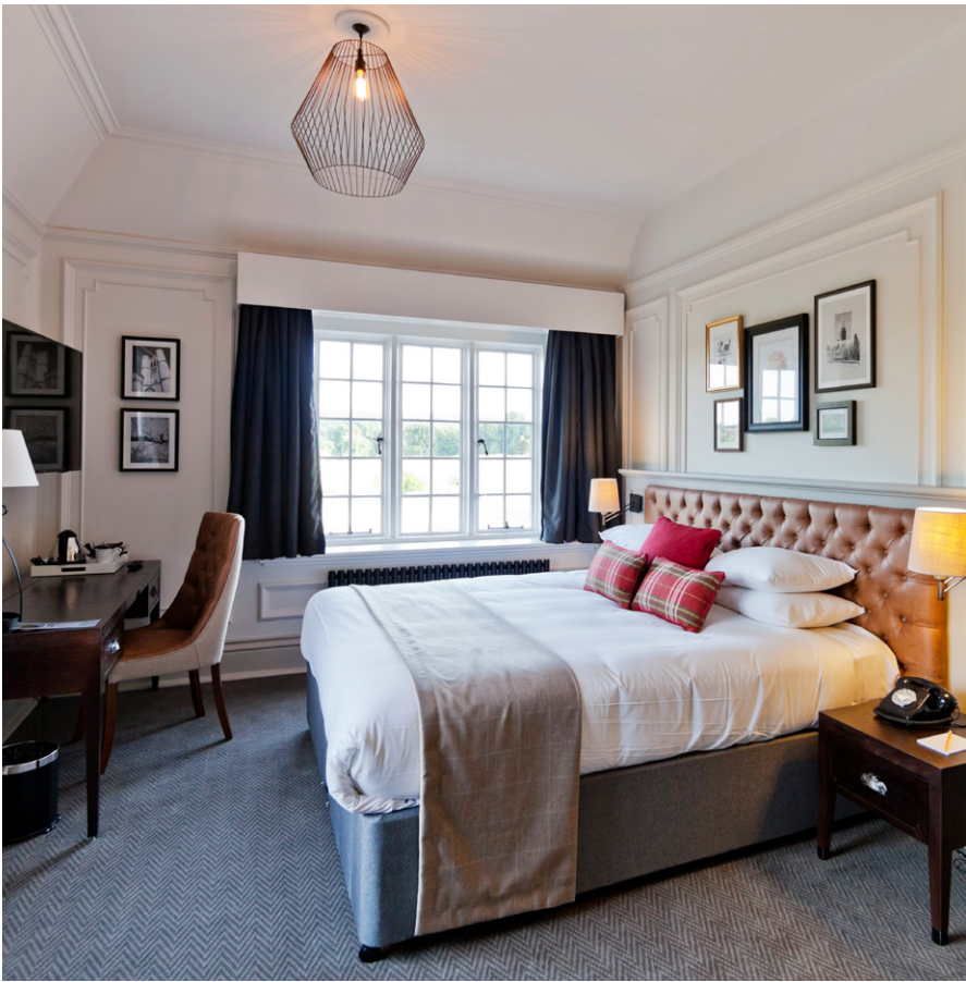
DE VERE HORSLEY ESTATE