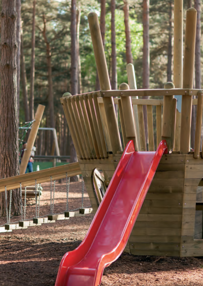
THE LOOK OUT DISCOVERY CENTRE